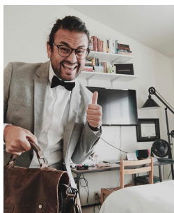
Meet Francisco Morazan!

Grade: Kindergarten (the smartest kids on the peninsula)